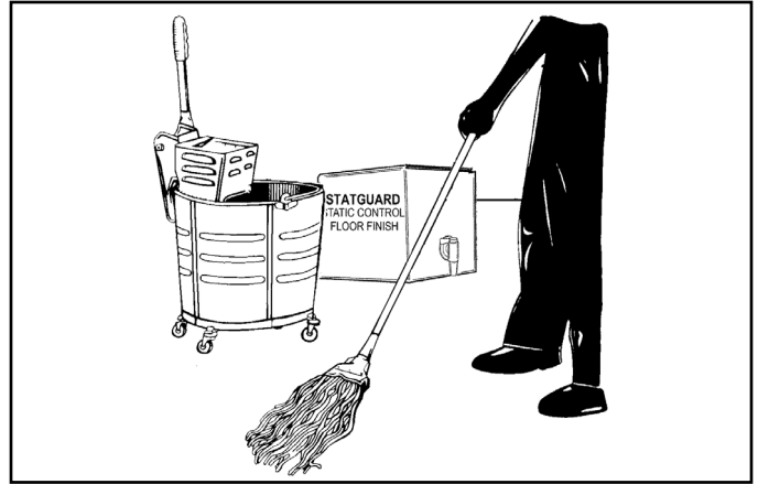
Figure 4. Applying floor finish