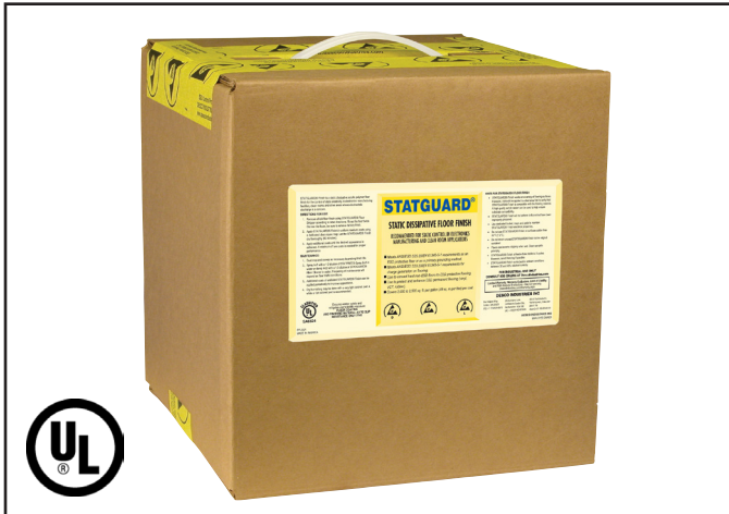
Figure 1. Statguard® Static Dissipative Floor Finish