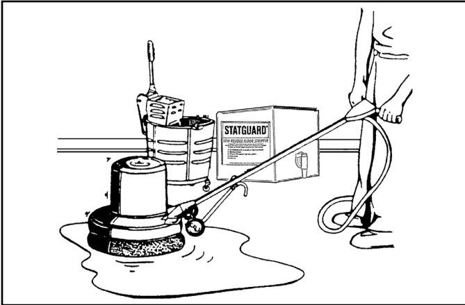
Figure 3. Stripping the floor