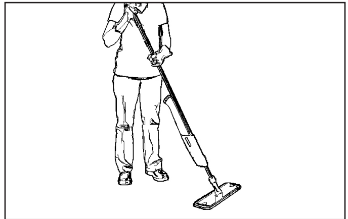
Figure 5. Applying floor finish with Flat Mop (optional).